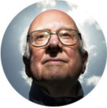
Boson prediction: Peter Higgs. PR

String theory is not an unshakable edifice erected 40 years ago; it is an idea that is constantly undergoing modifications and improvements in the light of new discovery, for example the incorporation of membranes and M-theory in 1995. It provides a way (so far the only way) of reconciling gravity with quantum mechanics, including inter alia the microscopic explanation for Hawking's quantum black hole radiation : necessary steps towards the final theory, but not easily accessible to experiment. Definitive experimental tests will require that the theory also incorporate and improve upon the standard models of particle physics and cosmology. An impressive body of evidence in favour of this has accumulated, but it is still work in progress. Rest assured that, if anyone found another more promising tree, the 1,500 would start barking up that one.