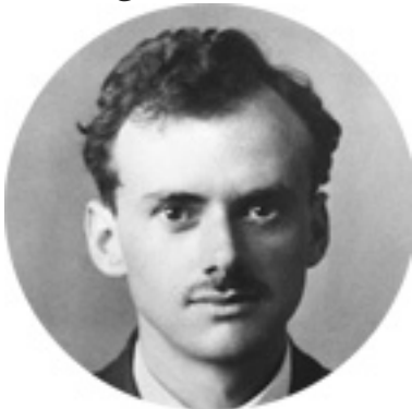
Quantum pioneer: Paul Dirac PR

MD Yours is a common fallacy. Dirac did not assume the positron; he discovered it to be a consequence of an equation that described the well-established electron. Similarly, string theorists did not assume supersymmetry, extra dimensions, the dualities of M-theory or the myriad possible universes; they discovered them to be consequences of a theory that subsumes empirically well-established features such as general relativity, gauge field theory and chiral quarks and leptons. Current research is devoted to finding out what else M-theory requires.